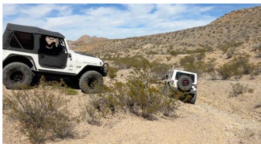
Crosby's following Doug E. down into the rock alley.

Cat Scratch is like Doug's Dilemma in that there is an uphill boulder garden with obstacles followed by a downhill section that tests completely different skills.