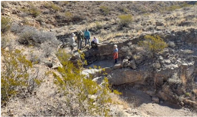
We took a few minutes to nerd out at the waterfall. We could see the lines to make the climb!

accomplished necessary trail clearing and marking, we all took a turn to run Arch from the exit down to the waterfall, getting more tracks on that section of trail. Even without running the waterfall, Arch Canyon offers some technical rock crawling which is loads of fun! After a great morning's work, we took a break and relaxed for lunch at the Arch exit, before heading over to play on Cat Scratch.