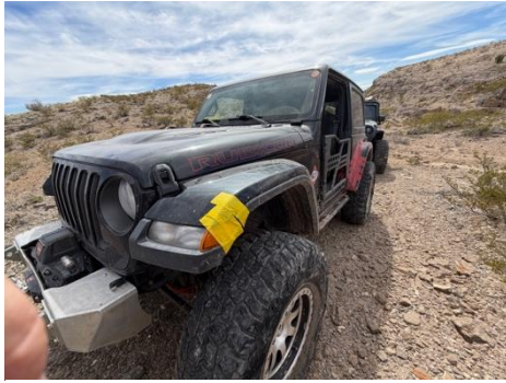
A girl's gotta have goals: Tear off enough of the factory fender flares to justify the mods I want, LOL.

A section of the trail approaching the crest of the hill was a boulder garden that felt like rock crawling on marbles. Since the trail isn't well beat in right now, our tires were moving rocks like crazy as we went through. Driver input from the steering wheel was more a general suggestion of where you hoped to go, versus where the tires ended up tracking.