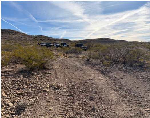
Parked at the Arch Canyon exit, on