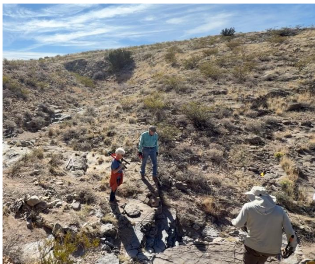
We don't usually pack loppers for rock crawling!

Midweek, prior to my run, I passed this information along to my participants. Without any hesitation, everyone jumped in to say they would be willing change our plans for a full day of play to a TBD kind of day, tackling trail maintenance on Arch and then seeing what else